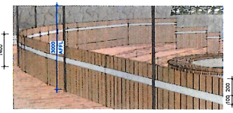
2 Reference Image - New Timber Fence NTS

Light fitting to be replaced on all lamp posts new IP rated festoon lights through out fixed to building wall, ensure enough support is provided.