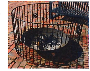
3 Reference Image - Existing Fire Pit NTS / 1:25 @ A1