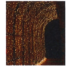
4 Reference Image - Fairy Lights NTS